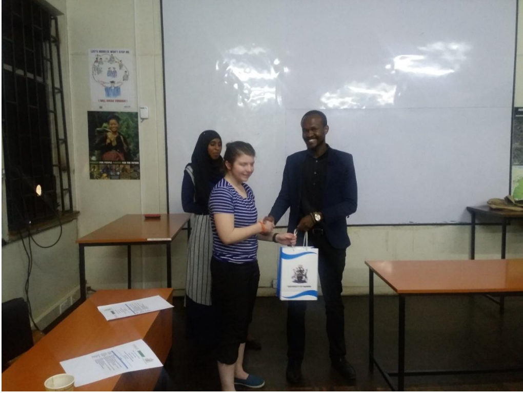
UoN students presenting a gift to the Canadian students